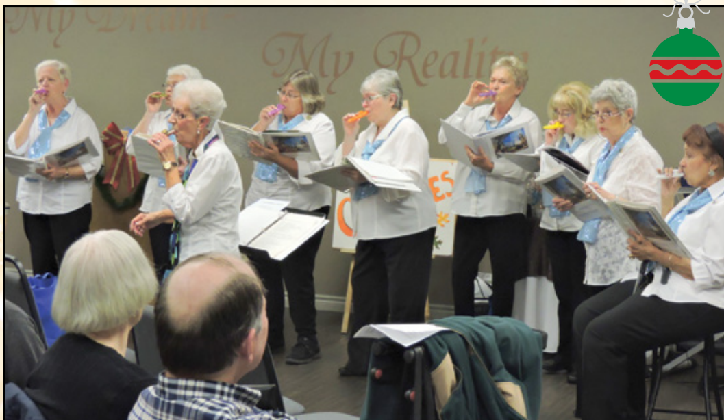
The Covettes kazooing