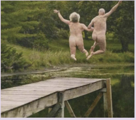
Caption Credit: Rob McEachern